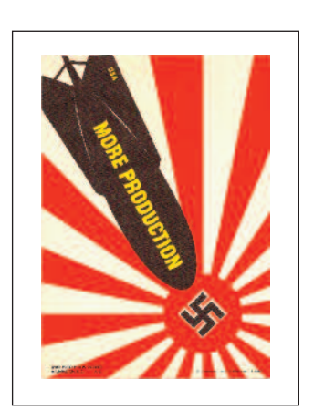
Anonymous (American), MORE PRODUCTION, ca. 1942. Color lithograph poster.

In order to contextualize the Ansel Adams photographs and attempt to demonstrate fully the anxiety and paranoia in America in the days after Pearl Harbor that led to the unjustified forced evacuation of innocent citizens we have included in this exhibition propaganda posters, pennants, and magazine covers that illuminate the anger and outright racial prejudice in America at that time. The nation was at war and the Empire of Japan was the enemy. However, the antagonism against Germany and Italy at that time was almost solely directed at those countries' leaders not, as in the case of Japan, at a whole ethnic race.