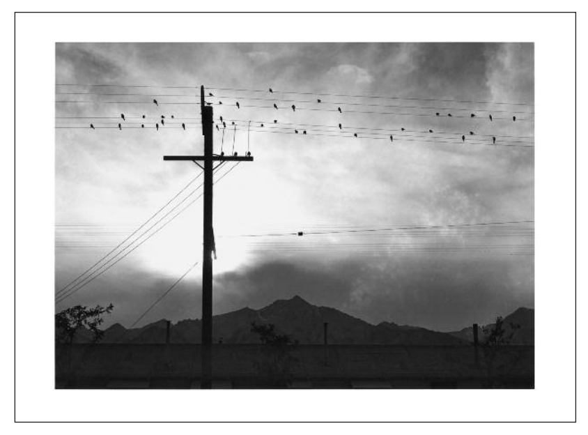
Ansel Adams (American, 1902–1984), BIRDS ON WIRE, EVENING, 1943. Gelatin silver print (printed later).