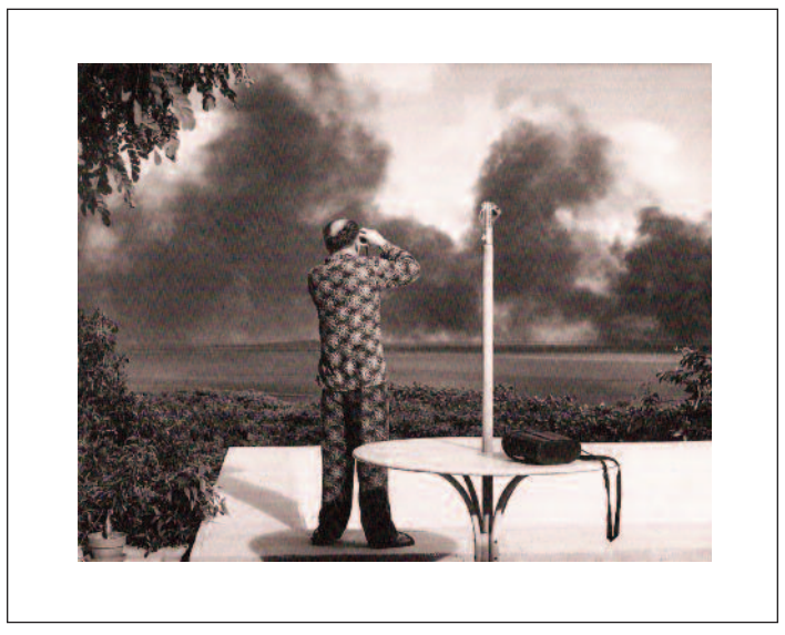
Baldwin H. Ward (American, 20th century), JAPANESE ATTACK PEARL HARBOR, 7:55 a.m., December 7, 1941. Gelatin silver print (printed later).

In the aftermath of the Japanese surprise attack on Pearl Harbor and the subsequent declaration of war by the United States, a wave of fear and paranoia swept the western United States and the Hawaiian Islands. Anxiety over possible invasion by Japanese forces or sabotage by fifth columnist Japanese and Japanese Americans living amongst the general American population overrode common sense in Government circles. Despite the protestations of Attorney General Francis Biddle, Interior Secretary Harold Ickes, and even F.B.I.