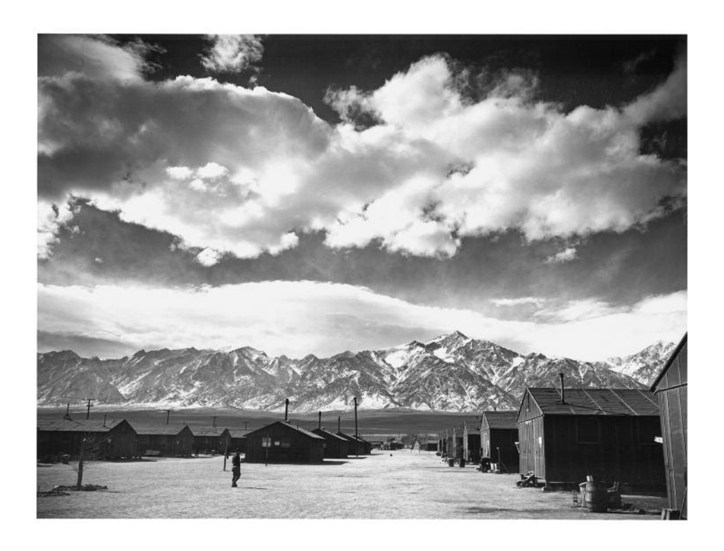
Ansel Adams (American, 1902–1984), MANZANAR STREET SCENE, SPRING, 1943. Gelatin silver print (printed later).