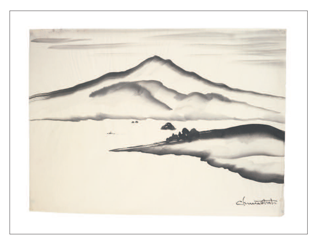
Chiura Obata (American, born Japan, 1885–1975), UNTITLED (San Francisco Bay with Mount Tamalpais), ca. 1940. Brush drawing