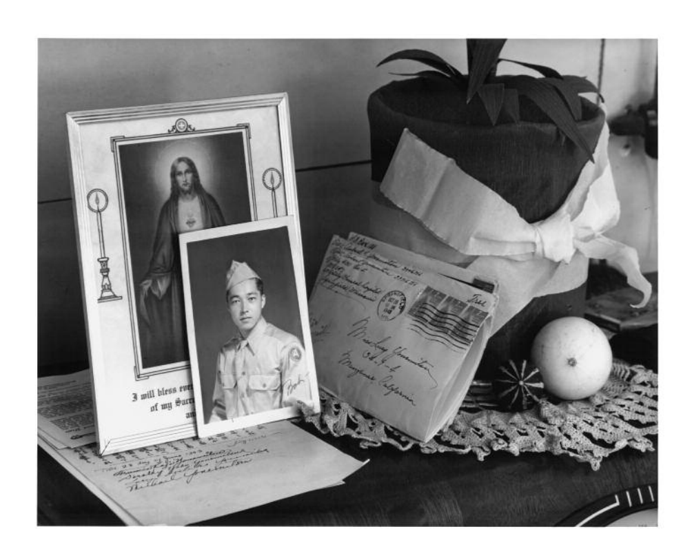
Ansel Adams (American, 1902–1984), PICTURES OF TOP OF PHOTOGRAPH, YONEMITSU HOME, 1943. Gelatin silver print (printed later).

internees' stoic, polite, even cheerful making the best of it. His subjects were almost exclusively happy, smiling. His goal was to establish the internees as unthreatening, Americanized, open—scrutable rather than inscrutable. By making mainly individual portraits, he masked collective racial discrimination. The resultant hiding of the internment's violation of human rights was not an unintended consequence of this goal, but an expression of Adams's patriotism."<sup>3</sup>